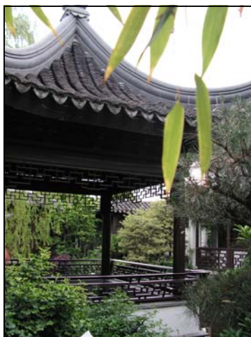
Example of a Chinese Garden in Portland

Presented by garden designer Daxin Liu, Fragrant Hill Design, Mountain View, CA