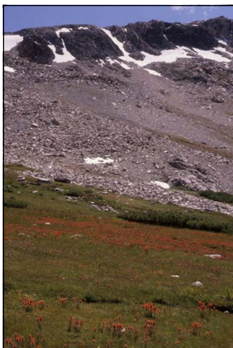
Castilleja peirsonii east side of Saddle Bag Lake near Tioga Pass - Ted Kipping

Saturday meet at 9:30 AM at the Café/Bateshop at Saddle Bag Lake, close to the top of Tioga Pass, Hwy 120. Each person will need to sign in individually at the wilderness registry inside the Café. There is also a sign up to ride the boat either or both ways to the north end of the lake. A plant list will be available. We will start walking clockwise along the lake trail.