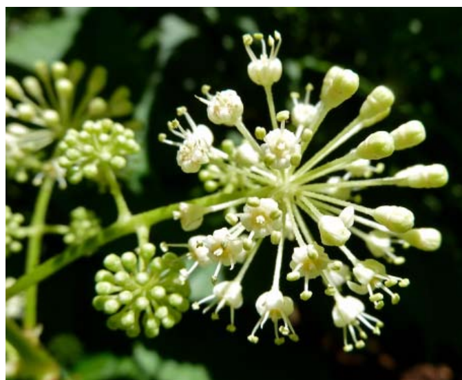
(Top) Established in a shady location, Aralia californica needs little extra water once established. (Bottom) Large white blossoms light up the shade during this plant's bloom.