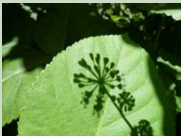
Plant of the Month Aralia californica